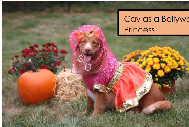
Cay as a Bollywood Princess.