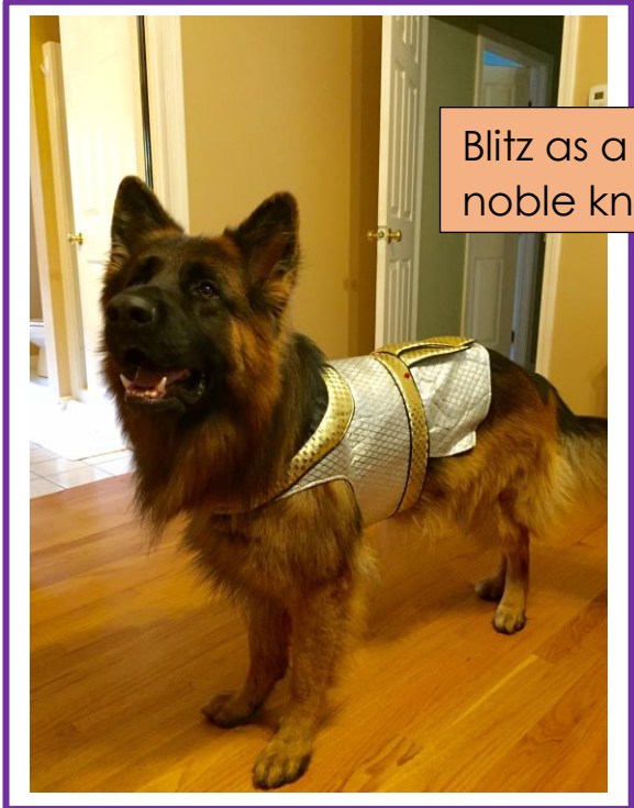
Blitz as a noble knight.