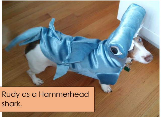
Rudy as a Hammerhead shark.